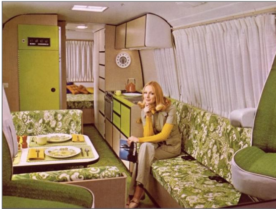
An original interior from a 1973 brochure

A healthy channel of dedicated vendors helps keep these coaches running and providing their owners with a high level of support. Enthusiastic owners are members of a bevy of clubs that are fully recognized by Family Motor Coach Association or are active participants in an online forum.