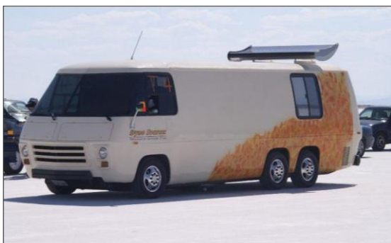
Dyno Sources' land speed record holder