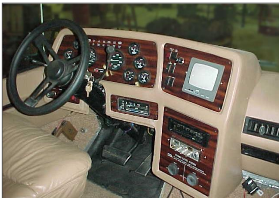
New dash by Custom Instrument Panels