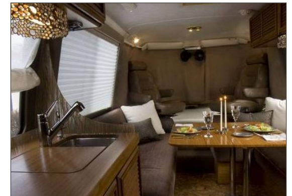
Looking forward: A renovated interior