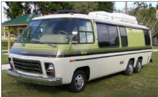
A restored unit that looks factory fresh