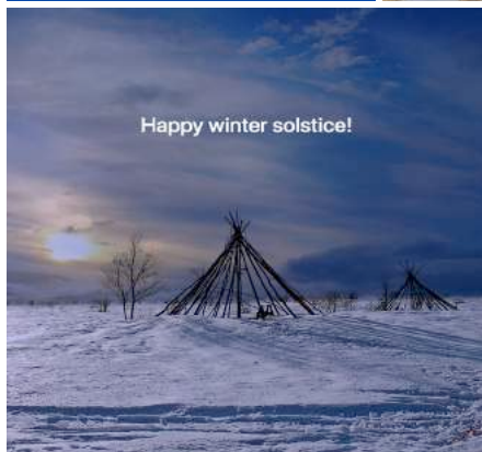
Happy winter solstice!

SZCZĘŚLIWEGO NOWEGO ROKU ШАСЛИВОГО НОВОГО РОКУ ਨਵੇ ਸਾਲ ਦੀਆਂ ਵਧਾਈਆਂ YENI YILINIZ KUTLU OLSUN GELUKKIG NIEUWAAR GOTT NYTT ÅR SHANA TOVA FELICITATE NYTT ÅR Feliz Año Nuevo Bonne année 良いお年を Frohes neues Jahr С Новым Годом С НОВЫМ ГОДОМ دى عى س ONNELLESTA UUTIA VUOTTA Καλή Χρονιά ES GUETS N'ÖIS Feliz Año Nuevo 2019 HAPPY NEW YEAR 新年好 HAPPY NEW YEAR FELIZ AÑO NUEVO La Multi Ani HAPPY NEW YEAR Felice anno nuovo SHANA TOVA FELICITATE NYTT ÅR あけまして おめでとう ございます Hyvää uutta vuotta FELICE ANNO NUOVO BOLD OG ÆVETATH BHLIAIN FAOI MHAISE STASTNY NOVÝ ROK FELIX SIT ANNUS NOVUS BLAGOJAVNO NOVO LETO BUON ANNO GOTT NYTT ÅR