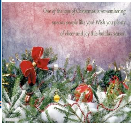
One of the joys of Christmas is remembering special people like you! Wish you plenty of cheer and joy this holiday season