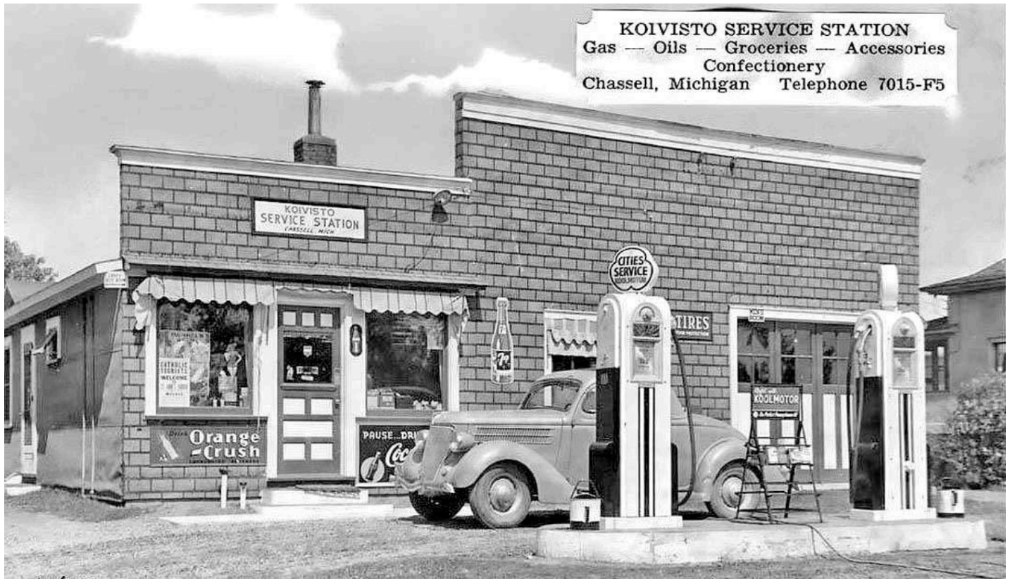
1930s Cities Service gas station and a 1936 Ford Coupe at the gas pumps

KOIVISTO SERVICE STATION Gas — Oils — Groceries — Accessories Confectionery Chassell, Michigan Telephone 7015-F5