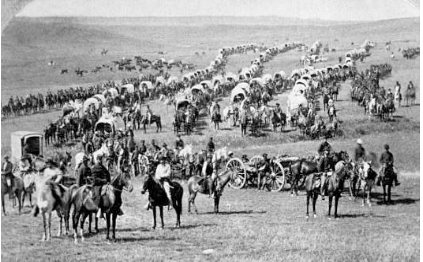
The first rally held in the United States.