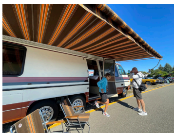
Visitors exiting my 1978 Royale during the M1 Concourse "Speed and Style Expo."