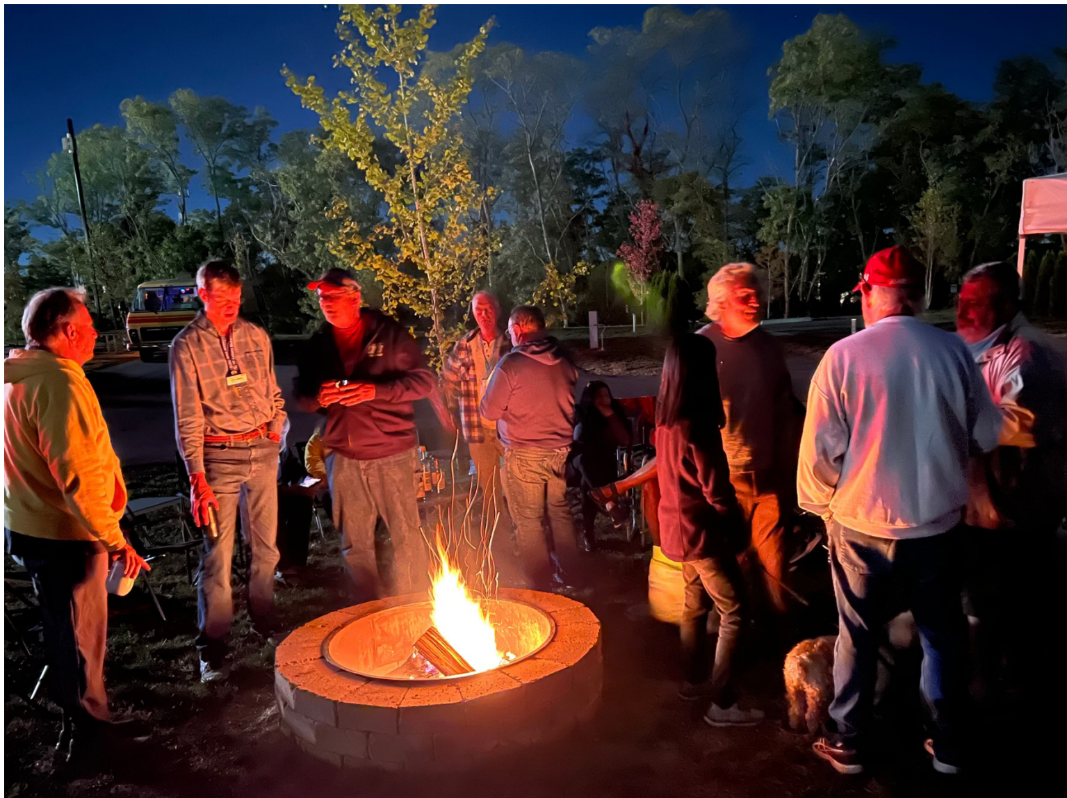
A perfect evening for a bonfire during the last rally of the year.