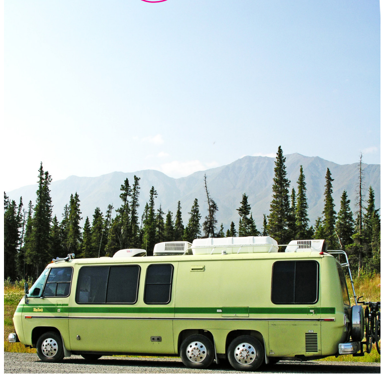
1977 Palm Beach, July 13, 2005, on the Alaska Highway taken between Kluane Lake and Beaver Creek, Alaska.