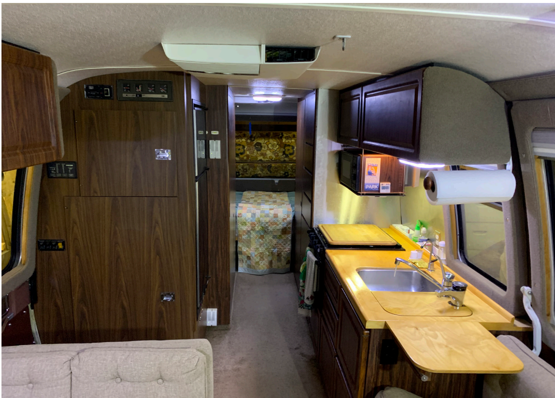
The interior of our 1976 Eleganza II.

I then worked out of Chrysler's Highland Park headquarters and eventually to Auburn Hills when the headquarters relocated there. I took an early retirement in 2001.