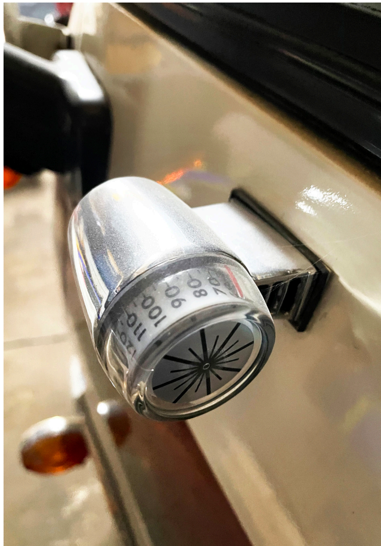
1978 Royale OEM temperature gauge.

Please remember to pay your dues for 2023 and contact me if you have any questions at membership@gmcgreatlakers.org .