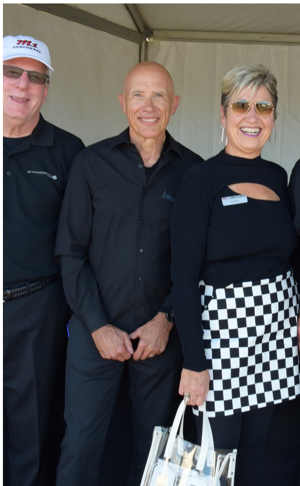
M1 Concourse Ambassadors during the 2021 American Speed Fest Garage Reveal.