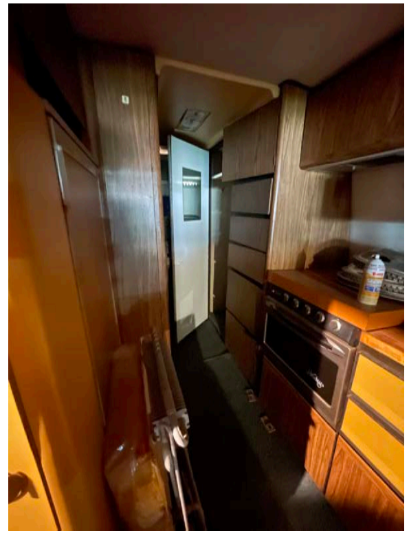
1973 Canyon Lands interior. Second GMC sold to the public at the Pontiac Transportation Museum.