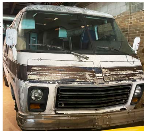
At the Pontiac Transportation Museum: The second GMC sold to the public, a 1973 Canyon Lands.