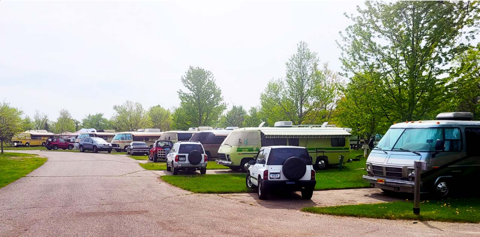
Camp Dearborn on May 12, 2023