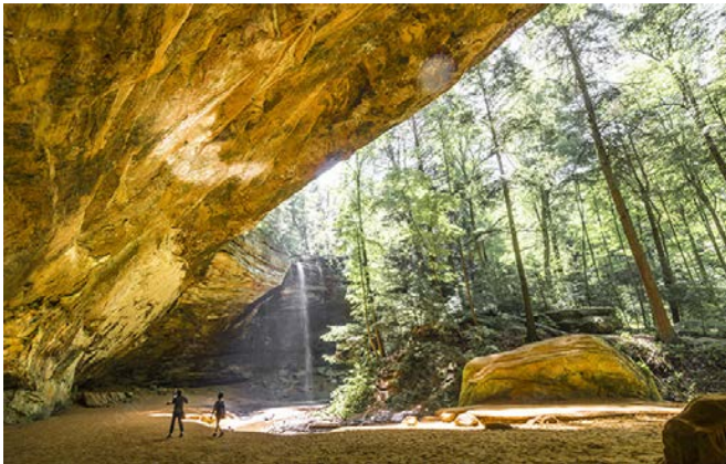
Ash Cave.

The main attraction in the area is Hocking Hills State Park. In some areas the park adjoins the Hocking State Forest. Within the park are over 25 miles of hiking trails, rock formations, waterfalls, and recess caves. Friday and Saturday were spent exploring Ash Cave, Old Man's Cave, Rock House, Conkle's Hollow, Cedar Falls, Cantwell Cliffs, and Whispering Cave Trail.