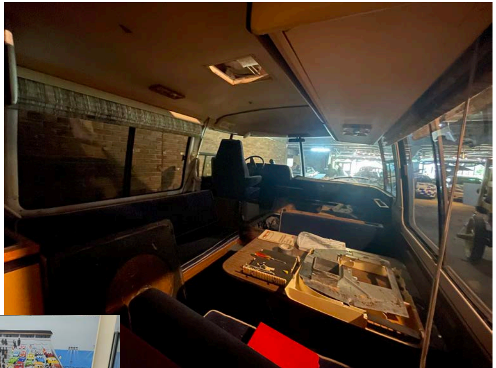
1973 Canyon Lands interior. Second GMC sold to the public at the Pontiac Transportation Museum.