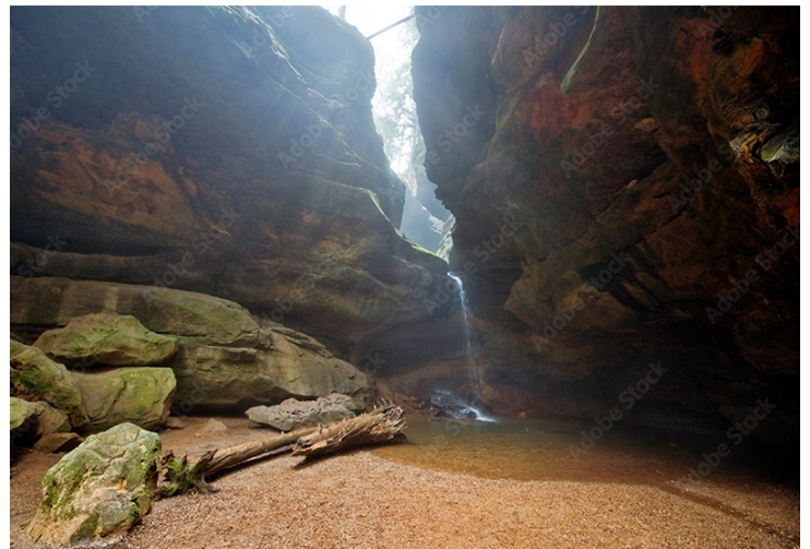
Conkle's Hollow.

And of course we ate. Thursday was pot luck hors d'oeuvres, Friday, BBQ from Millstone Southern Smoked BBQ (great reviews from our members) and Saturday was pot luck soup and salad and desserts. There are some great cooks among us.