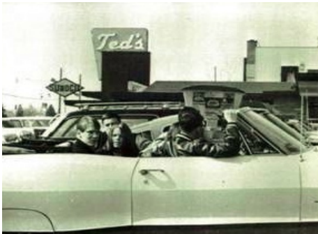
Ted's Drive In: A cruising destination for decades.