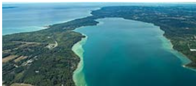
Above: Bellaire Lake, Photo from the campground website.

Downtown Bellaire is filled with unique craft shops, local boutiques, and cozy cafes. Or visit The Village at Grand Traverse Commons. This historic site is a vibrant community with shops, restaurants, and beautiful grounds.