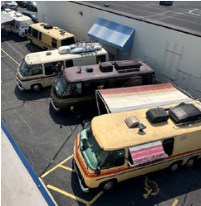
Above: GMCs at the 2024 Car Show

On August 2nd, from 9am-2pm, we will be hosting the Lakeshore Community Car Show at our roller skating rink, Rollxscape Skating Center , in Holland, MI.